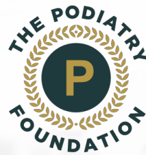
Exhibit Booths Visit & Win Prizes!

Stop by the exhibit booths to explore and learn about new innovations, products and services from top industry members. For every booth that you visit, you will receive a ticket to enter your name into drawings for a variety of prizes!